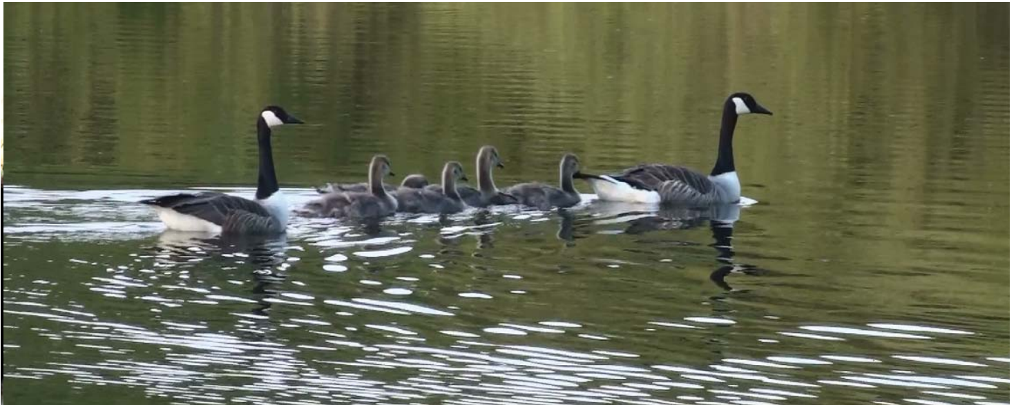
Sid & Family