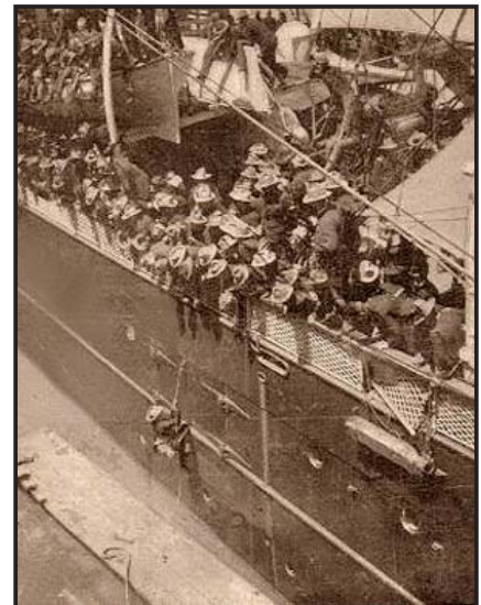
FIG. 2 - 1st California ship - where it arrived on June 30.

Philippine-American War began on February 4, 1899. On July 26, 1899, the First California Volunteer Infantry left the Philippines for the United States, arriving in the U.S. on August 24, 1899. The unit was mustered out of service on