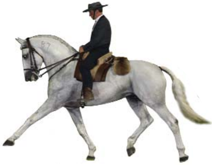
Fig.2 - Uivador Da Broa

attend shows and events around the World. Marcia and Janine's way of training horses is also a merit to their philosophy. With patience and kindness, they allow the horses to live in fields together in their natural environment, which has led to many clients from all over the UK not only buying their horses from the stud, but also keeping their horses stabled there. The staff that work there are also very experienced and dedicated. There are a host of Riding School Activities available including Classical Dressage on a Lusitano Stallion. A must for people who are seriously into Dressage and especially to do it on one of their magnificent Stallions. They offer general riding lessons on well schooled horses and a variety of Hacks, either along quiet country lanes or more adventurous Mountain Treks. Plus a Beach and Pub ride which lasts about 4 hours and even Stable Days which includes a Hack Lesson. For the Londoner it is close to the up market and extremely popular village of Abersoch, where the yearly Jazz Festival and of course the Internationally popular Wakestock Pop and Rock Festivals are held in June and July respectively. If you need accommodation then that is close by and can be arranged via the Stables in a range of Hotels, B&B's, and Self - Catering Cottages to suit most budgets.