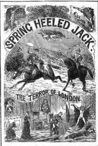
The history of this remarkable being has been specially compiled for this work only, by one of the best authors of the day, and our readers will find that he has undoubtedly succeeded in producing a wonderful and sensational story, every page of which is replete with details of shocking and thrilling interest.

544 THE BOYS STANDARD. Published Weekly. NOW READY. Price One Penny. NO. 1 JANU 2 (TWENTY-FOUR PAGES, SPLENDIDLY ILLUSTRATED, IN HANDSOME WRAPPER.