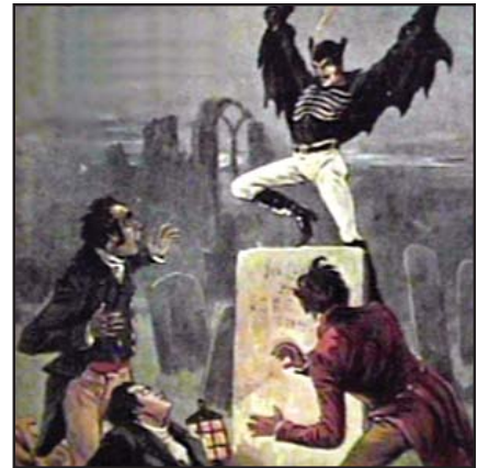
Spring Heeled Jack

The story of the leaping terror is indeed weird to say the least. All who saw him reported that