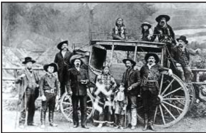
Buffalo Bill's Wild West Circus

the UK in the late 1800's early 1900's. Bill even stayed at my old house in Fulham and drew a picture of himself on one of the bedroom walls. Such modest working class houses are now worth huge sums in today's market, but in those days, it was very different.