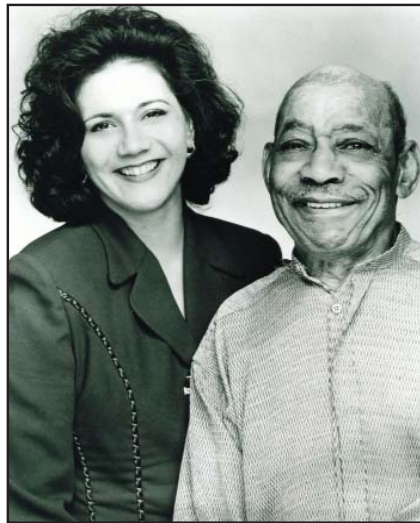
Jimi's Mum and Dad

Chas Chandler first met Hendrix in 1966 in the States and Chas persuaded him to let him be his manager. He brought him to London and married him up with Noel and Mitch and The Jimi Hendrix Experience was born. Their first