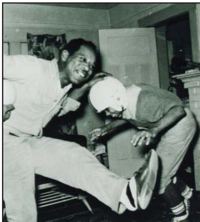
Rare family photographs